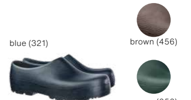
55.025.0 PURCEL PROFI GARDEN CLOG Sizes: 36 - 47