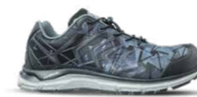
64.666.0 ENERGY IMPULSE GREY LOW S1P ESD HRO SRA Sizes: 39 - 47