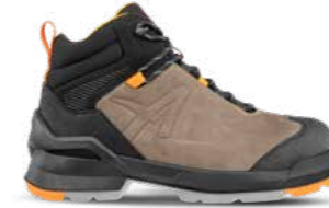
63.802.0 TARAVAL BROWN MID S3L ESD FO SR Sizes: 36 - 47