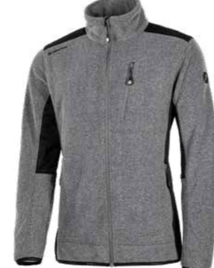
26.444.0 MARIBO // FLEECE JACKET S - 3XL