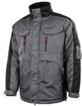
27.092.0 CELSIUS // WORKER PARKA S - 4XL