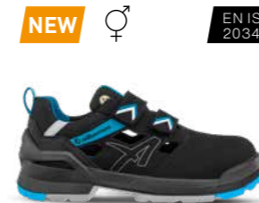
64.806.0 FORGE AIR BLACK/BLUE LOW S1 ESD FO SR Sizes: 36 - 50