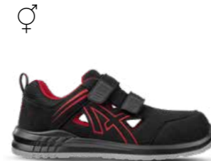
64.878.0 CLIFTON AIR LOW S1 ESD SRC Sizes: 36 - 47