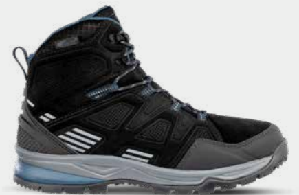
67.672.0 LOFOTEN 2.0 BLACK CTX MID Sizes: 40 - 46