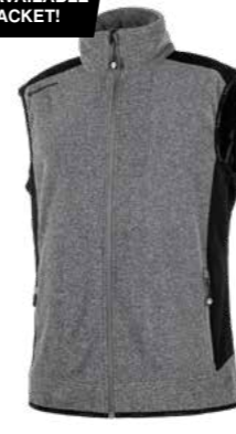
27.993.0 KERRY // FLEECE VEST S - 3XL