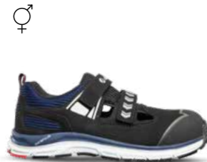
64.753.0 JETSTREAM IMPULSE LOW S1 ESD HRO SRA Sizes: 36 - 47