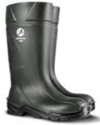
59.088.0 TITAN S5 CI SRC PU-SAFETY BOOT Sizes: 37 - 48