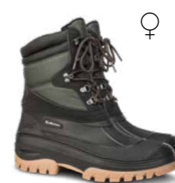
58.112.0 HUDSON LINED LACED BOOT Sizes: 36 - 47