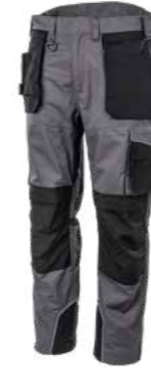
CORDURA YKK 28.662.0 EXPERT 360° // TROUSERS 24 - 27, 48 - 58