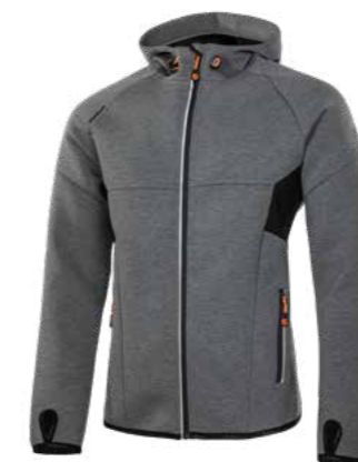
26.419.0 KOLARI // SWEATSHIRT-JACKET S - 3XL