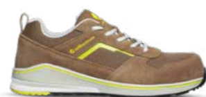
64.761.0 COURT SAND LOW S1P ESD HRO SRC Sizes: 39 - 48