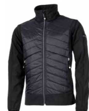
26.704.0 BRADLEY // HYBRID JACKET S - 3XL