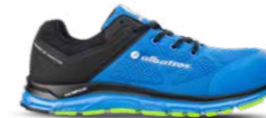
64.661.0 LIFT BLUE IMPULSE LOW S1P ESD HRO SRA Sizes: 39 - 47