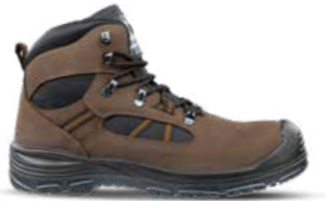
63.134.0 TIMBER MID S3 SRC Sizes: 39 - 47