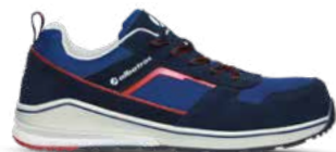
64.764.0 COURT BLUE LOW S1P ESD HRO SRC Sizes: 39 - 48