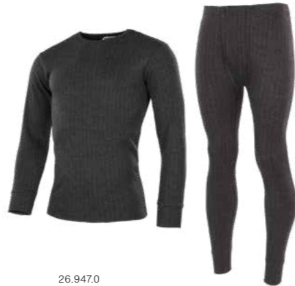
26.947.0 THERMOGETIC LA // THERMO-FUNCTIONAL SHIRT Sizes: S - 2XL (5 - 9)