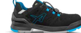
64.804.0 FASTPACK BLACK/ BLUE LOW S1PL ESD FO SR Sizes: 36 - 50