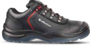
64.108.0 GRAVITATION LOW S3 SRC Sizes: 39 - 48