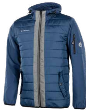
26.708.0 TOSMAR // QUILTED / SOFTSHELL JACKET S - 3XL