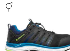
64.752.0 BREEZE IMPULSE LOW S1P ESD HRO SRA Sizes: 36 - 47