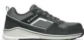
64.763.0 COURT GREY LOW S1P ESD HRO SRC Sizes: 39 - 48