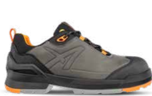
64.802.0 TARAVAL GREY LOW S3L ESD FO SR Sizes: 36 - 47