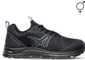
65.490.0 AER55 ST BLACK LOW O1 ESD HRO SRA Sizes: 36 - 42