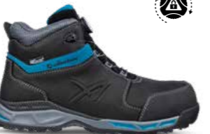
63.850.0 TOFANE BLACK QL CTX MID S3 WR ESD HRO SRC Sizes: 40 - 47