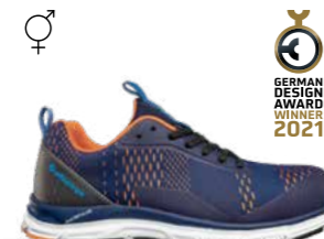
64.751.0 AER55 IMPULSE BLUE ORANGE LOW S1P ESD HRO SRA Sizes: 36 - 47