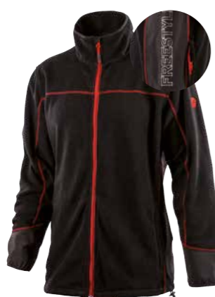
26.439.0 FREESTYLE SR // FLEECE JACKET XS - 3XL