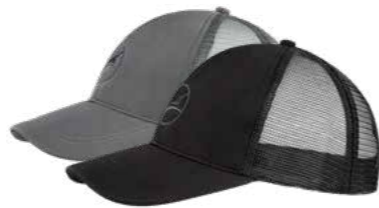
25.423.0 POWER // SOFTSHELL-BASEBALLCAP ONLY IN ASSORTMENS: 10 PIECES/COLOUR