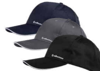
25.442.0 EASKY // BASEBALLCAP ONLY IN ASSORTMENS: 10 PIECES/COLOUR