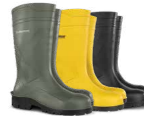
59.025.0 PROTECTOR PLUS S5 SRC SAFETY BOOT Sizes: 39 - 48