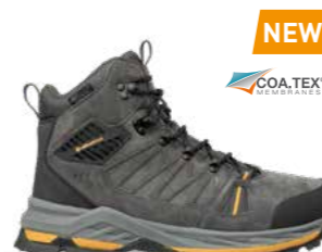
67.647.0 TERANO GREY CTX MID Sizes: 36 - 46