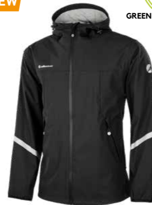
27.487.0 HADLEY // RAIN JACKET S - 3XL