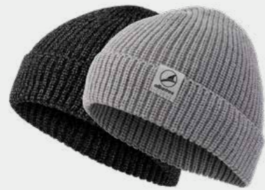
25.527.0 CLAY // KNITTED CAP Sizes: One Size