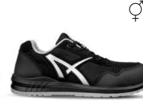
64.901.0 DRIFTER BLACK ST LOW O1 ESD SRC Sizes: 36 - 47