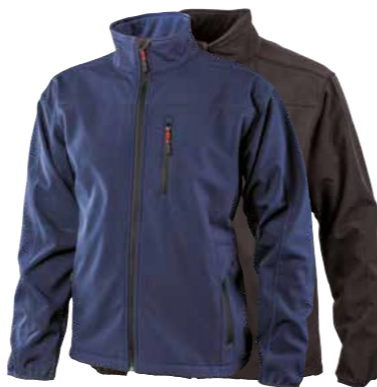
26.371.0 KEPLER // SOFTSHELL JACKET S - 3XL