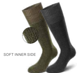
24.090.0 THERMO CONTROL LG // LONG SHAFT BOOT SOCK Sizes: 39/41, 42/44, 45/47, 48/52