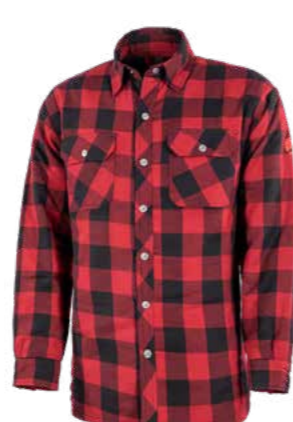
29.210.0 TILER // THERMOSHIRT S - 3XL