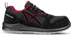
64.870.0 CLIFTON LOW S3 SRC Sizes: 36 - 47