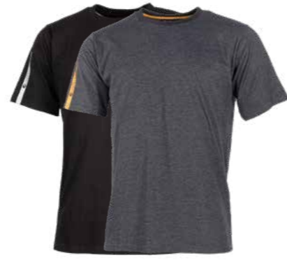
29.804.0 CORBET // T-SHIRT S - 3XL