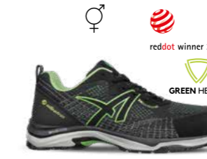
64.630.0 SPELNDID GREEN GH LOW S1P ESD HRO SRC Sizes: 36 - 47