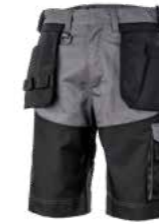
CORDURA YKK 28.663.0 EXPERT 360° // SHORTS 50 - 56