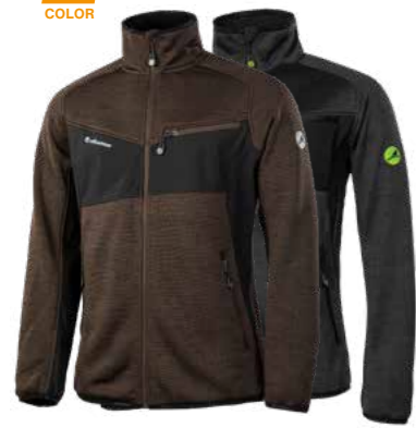
26.433.0 CONCEPT KNIT // KNITTED/ SOFTSHELL JACKET S - 3XL