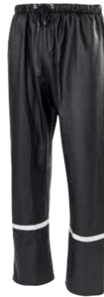
27.452.0 FORECAST TRS // PU-STRETCH-RAIN TROUSERS S - 3XL