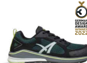
64.765.0 AER58 GREEN LOW S1P ESD HRO SRC Sizes: 39 - 48