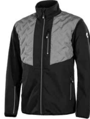
26.709.0 WICKLOW // HYBRID JACKET S - 3XL