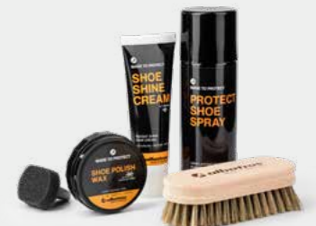
20.910.0 ALBATROS SHOE CARE SET