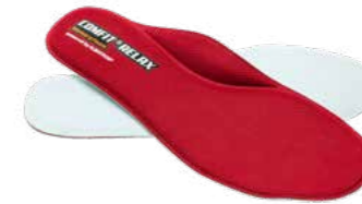
20.480.0 COMFIT®RELAX MEMORY FOAM FOOTBED