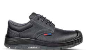
64.185.0 SOLID LOW S3 SRC Sizes: 37 - 47