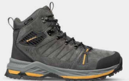
67.647.0 TERANO GREY CTX MID Sizes: 36 - 46