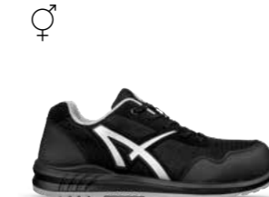
64.877.0 DRIFTER BLACK LOW S1P SRC Sizes: 36 - 47