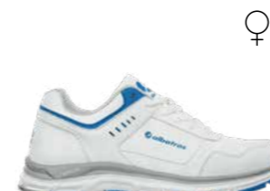
65.492.0 WHIZ ST WHITE WNS LOW O2 ESD HRO SRA Sizes: 36 - 42