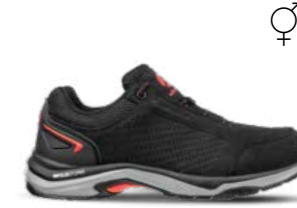
65.443.0 VIALE BLACK LOW O1 HRO SRC Sizes: 36 - 47