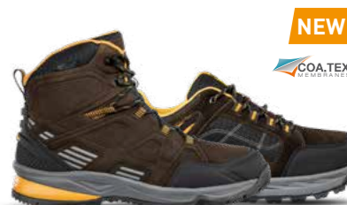
67.671.0 | 65.670.0 LOFOTEN 2.0 BROWN CTX MID | LOW Sizes: 40 - 46