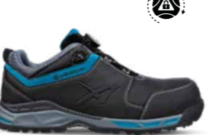
64.851.0 TOFANE BLACK QL LOW S3 ESD HRO SRC Sizes: 40 - 47