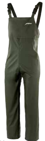
27.445.0 FAHRENHEIT LAZHOSE // PU-STRETCH-DUNGAREES S - 3XL