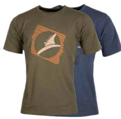
29.805.0 DERCOCK // T-SHIRT S - 3XL