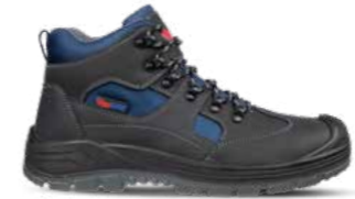
63.184.0 SAFE MID S3 SRC Sizes: 39 - 47