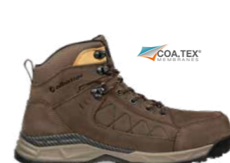
67.340.0 HÖFEN CTX MID Sizes: 41 - 47