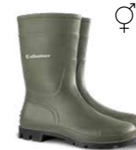
59.308.0 THE RANCHER PVC BOOT Sizes: 37 - 47