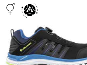
64.752.8 BREEZE IMPULSE QL LOW S1P ESD HRO SRA Sizes: 36 - 47