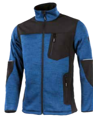
26.446.0 MAXWELL // KNITTED SOFTSHELL JACKET S - 3XL