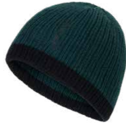
25.519.0 WINTER PRO // KNITTED CAP ONLY IN ASSORTMENS: 10 PIECES