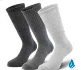
24.040.0 PROTECTION TRIO // WORKER SOCK Sizes: 39/42, 43/46