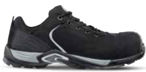
64.146.0 RUNNER XTS LOW S3 HRO SRC Sizes: 39 - 47