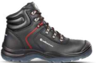
63.108.0 GRAVITATION MID S3 SRC Sizes: 39 - 48