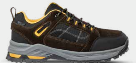
65.670.0 LOFOTEN 2.0 BROWN CTX LOW Sizes: 40 - 46