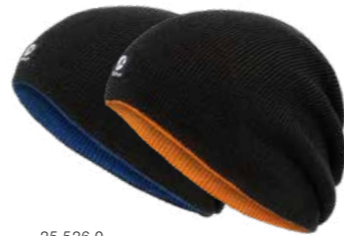
25.526.0 HUSKY // KNITTED CAP ONLY IN ASSORTMENS: 10 PIECES 5 pieces black-blue, 5 pieces black-orange