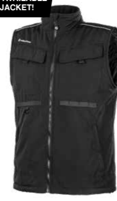
27.976.0 TIBER // WORKER VEST S - 3XL