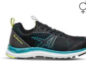
65.494.0 AER55 ST BLACK BLUE LOW O1 ESD HRO SRA Sizes: 36 - 47