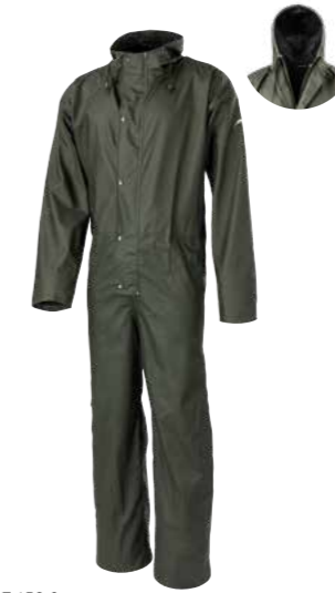
27.453.0 FAHRENHEIT OVERALL // PU-STRETCH-RAIN OVERALL M - 3XL