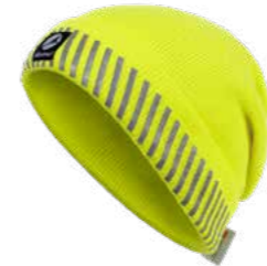
25.525.0 HIVIS THERMO // KNITTED CAP ONLY IN ASSORTMENS: 10 PIECES