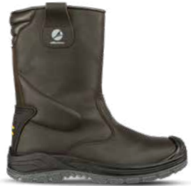
63.150.0 RIGGER BOOT BRN S3 CI SRC Sizes: 40 - 47