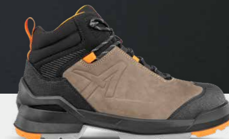
63.802.0 TARAVAL BROWN MID FLEXLITE