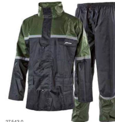
27.543.0 SUPERCCELL // RAIN SUIT S - 3XL