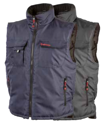
29.975.0 HERTZ // WORKER VEST S - 4XL