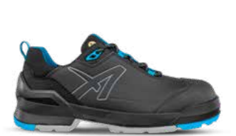
64.803.0 TARAVAL BLACK/BLUE LOW S3L ESD FO SR Sizes: 36 - 50