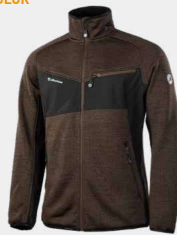
26.433.0 CONCEPT KNIT // KNITTED/SOFTSHELL JACKET Sizes: S - 3XL