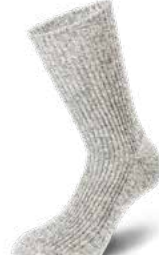
24.092.0 NORWEGER SH // NORWEGIAN SHORT SOCKS Sizes: 39/40, 41/42, 43/44, 45/46, 47/48