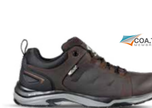
65.447.0 BRIONE CTX LOW O2 WR HRO SRC Sizes: 39 - 47