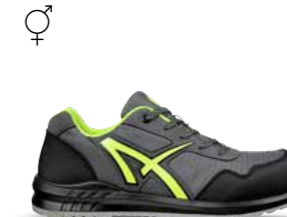
64.873.0 DRIFTER GREEN LOW S1P SRC Sizes: 36 - 47