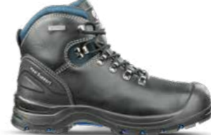
63.175.0 X-TREME CTX MID S3 WR HRO SRC Sizes: 39 - 47