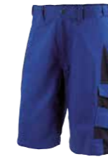
28.638.0 PROFI LINE // SHORTS XS - 4XL