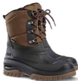
58.152.0 VANCOUVER LINED LACED BOOT Sizes: 36 - 47