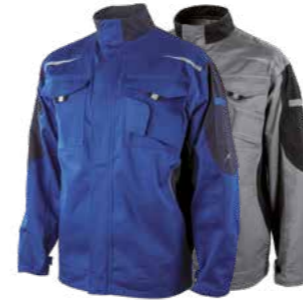
28.635.0 PROFI LINE // JACKET XS - 4XL