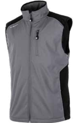
28.665.0 EXPERT 360° // SOFTSHELL VEST S - 3XL