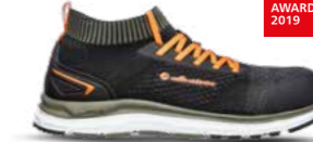
64.673.0 ULTIMATE IMPULSE OLIVE LOW S1P ESD HRO SRA Sizes: 38 - 47