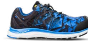
64.662.0 ENERGY IMPULSE LOW S1P ESD HRO SRA Sizes: 39 - 47

as SB, additionally to the basic requirements with closed heel area, antistatic, energy absorption of the heel area, fuel and oil resistant outsole and with penetration resistant midsole.