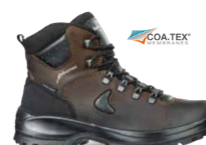
67.644.0 MONT BLANC CTX MID Sizes: 39 - 47