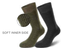
24.080.0 THERMO CONTROL SH // SHORT BOOT SOCK Sizes: 39/41, 42/44, 45/47, 48/52