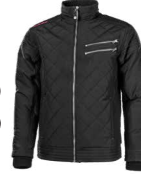
27.059.0 PIZZARO // JACKET S - 3XL