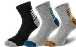
24.036.0 CONTROL TRIO // SNEAKER-WORKER SOCK Sizes: 39/42, 43/46