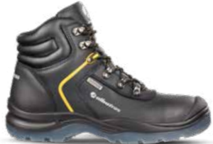
63.112.0 GRAVITY CTX MID S3 WR SRC Sizes: 39 - 48