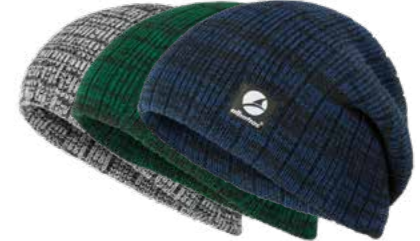
25.524.0 POLARGUARD // KNITTED CAP ONLY IN ASSORTMENS: 10 PIECES 4 pieces grey-black, 4 pieces blue-black & 2 pieces green-black