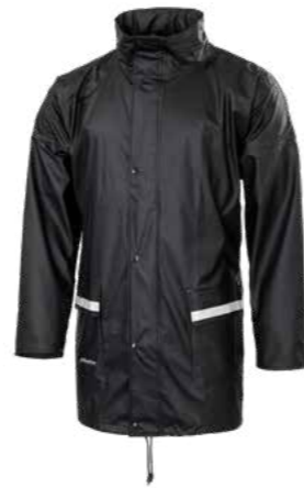
27.450.0 FORECAST JKT // PU-STRETCH RAIN JACKET S - 3XL