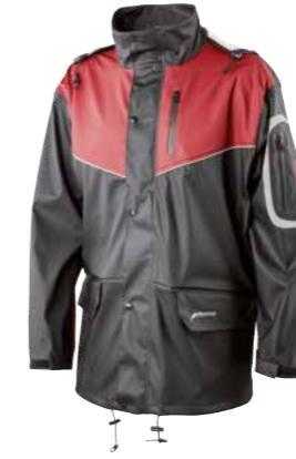
27.477.0 CLIMATE JKT // PU-STRETCH RAIN JACKET S - 3XL