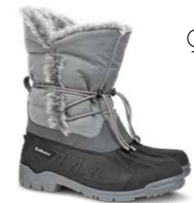
58.144.0 SCOTIA LINED LADIES WINTER BOOT Sizes: 36 - 42