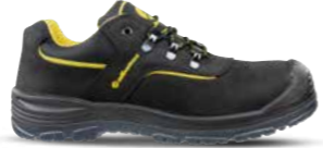
64.134.0 GRAVEL LOW S3 SRC Sizes: 39 - 47