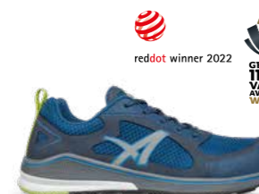
64.766.0 AER58 BLUE LOW S1P ESD HRO SRC Sizes: 39 - 48