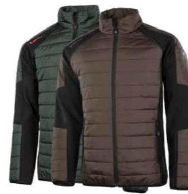
26.707.0 NARES // QUILTED JACKET S - 3XL