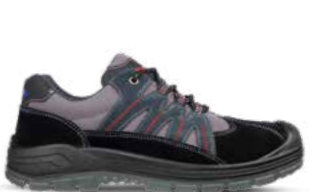
64.187.0 INNOVATIVE LOW S1P SRC Sizes: 39 - 47