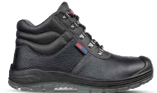
63.190.0 SOLID MID S3 SRC Sizes: 39 - 47