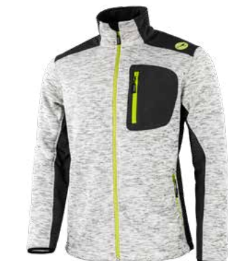
26.459.0 STIRLING // KNITTED SOFTSHELL JACKET S - 3XL