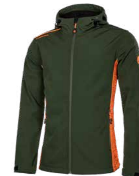
26.472.0 LISTER // SOFTSHELL / KNITTED JACKET S - 3XL