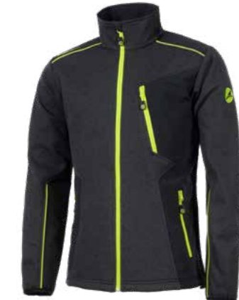
26.232.0 STRUCTURE // FLEECE JACKET S - 3XL