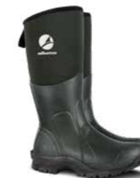
57.554.1 ONYX 2.0 NEOPRENE BOOT Sizes: 39 - 47