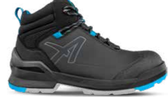
63.804.0 TARAVAL BLACK/BLUE MID S3L ESD FO SR Sizes: 36 - 50