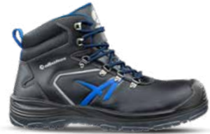
63.186.1 UNIT BAU MID S3 SRC Sizes: 39 - 47