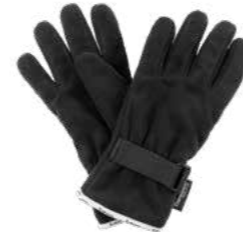
25.066.0 ICEBREAKER // MIKROFLEECE-GLOVES Sizes S - 3XL