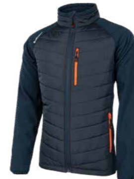
26.705.0 PARRY // QUILTED JACKET S - 3XL