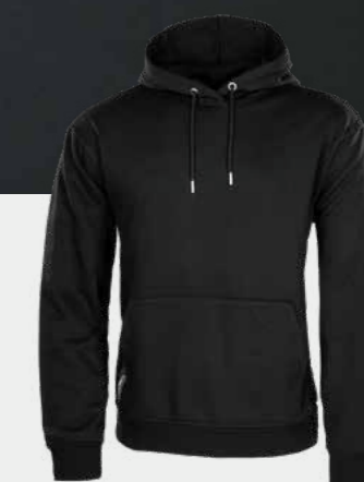
26.418.0 HAWLEY // HOODIE S - 3XL