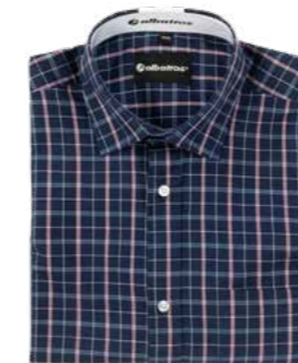
29.041.0 BRONZE 1/2 // SHORT SLEEVE SHIRT 39/40 - 49/50