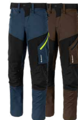
28.106.0 CONCEPT STRETCH TRS // STRETCH-TROUSER S - 3XL