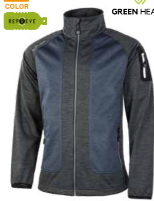
26.471.0 KINGSLEY // RECYCLING JACKET S - 3XL