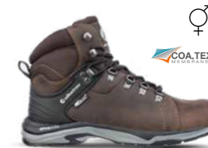
67.777.0 BRIONE CTX MID O2 WR HRO SRC Sizes: 36 - 47