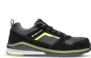
64.760.0 COURT BLACK LOW S3 ESD HRO SRC Sizes: 39 - 48