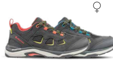
65.252.1 ACADIA GREY WNS LOW O1 HRO SRC Sizes: 36 - 42