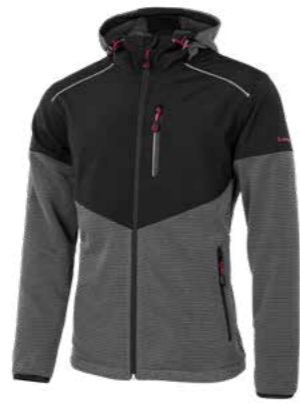
26.448.0 MITCHELL // KNITTED FLEECE/ SOFTSHELL JACKET S - 3XL