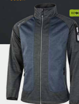
26.471.0 KINGSLEY // RECYCLING JACKET S - 3XL