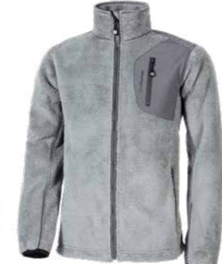
26.234.0 PILE // KNITTED/ FLEECE JACKET S - 3XL