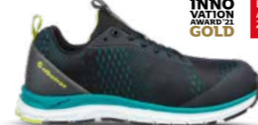
64.750.0 AER55 IMPULSE BLACK BLUE LOW S1P ESD HRO SRA Sizes: 36 - 47