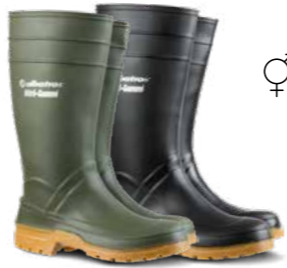
56.401.0 | 56.403.0 GUARDIAN HIGH GREEN | BLACK NITRILE RUBBER BOOT Sizes: 36 - 48