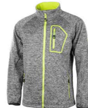
26.469.0 FRASER // FUNCTIONAL JACKET S - 3XL