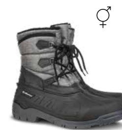
58.145.0 TORONTO GREY LINED LADIES WINTER BOOT Sizes: 36 - 47