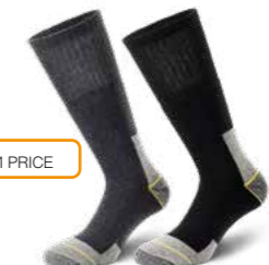
24.037.0 TEMPO DUO // LONG SHAFT WORKER SOCK Sizes: 39/42, 43/46