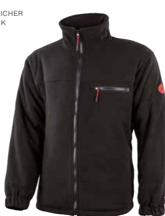
26.273.1 POLAR // WARMFLEECE-JACKET S - 4XL