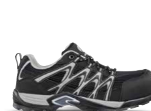
64.139.0 SILVER RACER XTS LOW S1P HRO SRC Sizes: 39 - 47