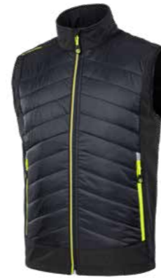
27.704.0 COOPER // HYBRID-VEST S - 3XL