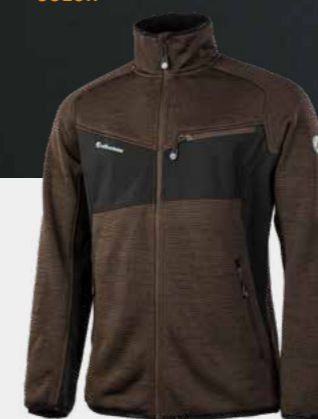
26.433.0 CONCEPT KNIT // RECYCLING JACKET S - 3XL