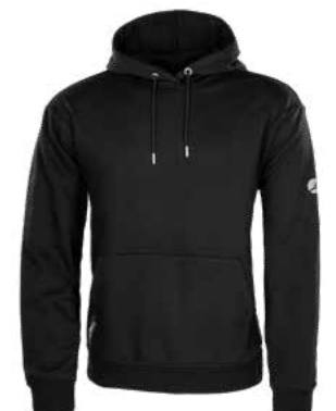
26.418.0 HAWLEY // HOODIE S - 3XL