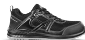
64.879.0 RIDER BLACK LOW S1P ESD SRC Sizes: 36 - 47