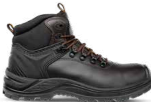
63.132.0 ENDURANCE MID S3 SRC Sizes: 39 - 47