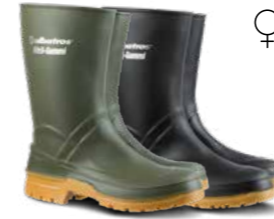
56.402.0 | 56.404.0 GUARDIAN MID GREEN | BLACK NITRILE RUBBER BOOT Sizes: 36 - 48