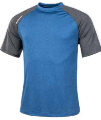
29.704.0 NAVAN // T-SHIRT S - 3XL