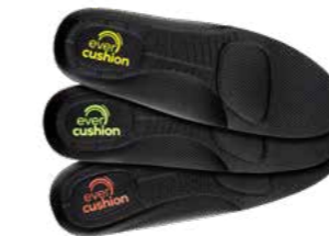
20.485.0 EVERCUSHION® CUSTOM FIT FOOTBED

Colours: LOW red (500), MID green (600), HIGH yellow (700) Sizes: 35 - 49