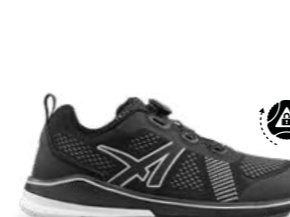
64.767.0 VOLTAGE BLACK QL LOW S1P ESD HRO SRC Sizes: 39 - 48