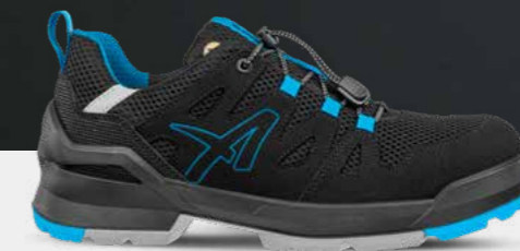
64.804.0 FASTPACK BLACK/BLUE LOW FLEXLITE