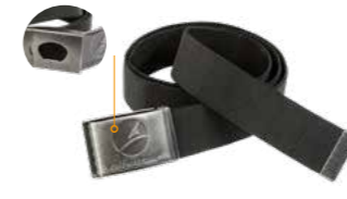
23.106.0 PADDOCK FLEX // BUCKLE BELT 120 cm (cut-to-fit)