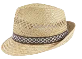
25.505.0 TRILBY // STRAW HAT Sizes: 54 - 61