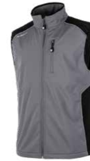
YKK 28.665.0 EXPERT 360° // SOFTSHELL VEST S - 3XL