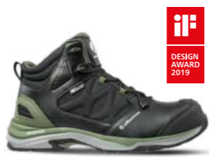
63.622.0 ULTRATRAIL OLIVE CTX MID S3 ESD WR HRO SRC Sizes: 39 - 47