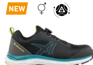
64.750.2 AER55 IMPULSE BLACK BLUE QL LOW S1P ESD HRO SRA Sizes: 36 - 47