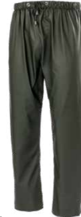
27.446.0 FAHRENHEIT TRS // PU-STRETCH-RAIN TROUSERS S - 3XL