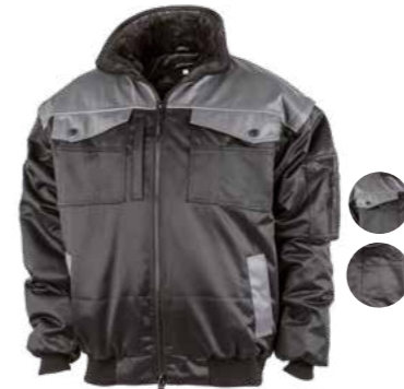
27.200.0 ALLROUNDER // PILOT JACKET 2 IN 1 S - 4XL