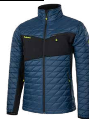
26.706.0 CONCEPT JACKET // QUILTED JACKET S - 3XL