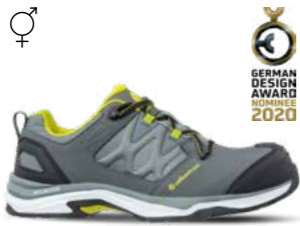
64.621.0 ULTRATRAIL GREY LOW S3 ESD HRO SRC Sizes: 36 - 47