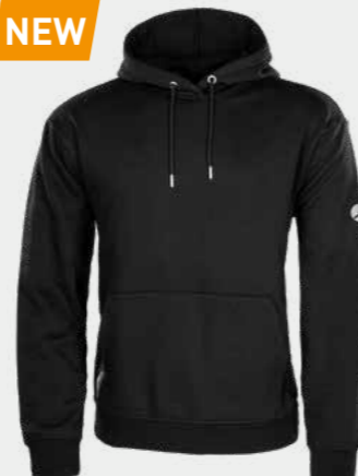
26.418.0 HAWLEY // HOODIE Sizes: S - 3XL