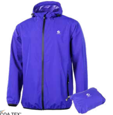
COA.TEX MEMBRANES 27.547.0 WRAP ME CTX // RAIN JACKET M - 2XL