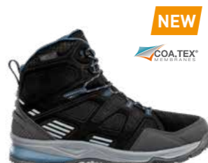
67.672.0 LOFOTEN 2.0 BLACK CTX MID Sizes: 40 - 46