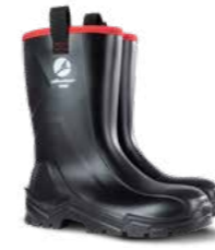
59.089.0 TITAN RIGGER S5 CI SRC PU-SAFETY BOOT Sizes: 39 - 49