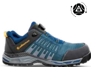
64.852.0 ANTELAO QL LOW S3 ESD HRO SRC Sizes: 40 - 47