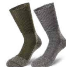
24.140.0 GUARD // WORKER SOCK Sizes: 39/41, 42/44, 45/47