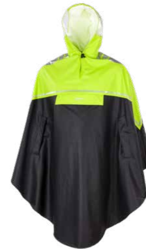
27.544.0 CYCLONE // RAIN CAPE M/L