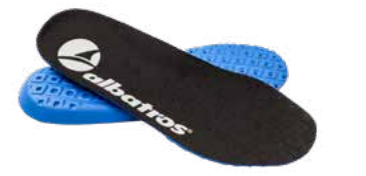
20.475.0 COMFIT®AIR FOOTBED