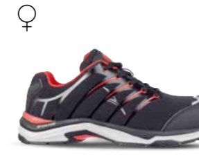
64.521.0 TWIST RED WNS LOW S1P ESD HRO SRC Sizes: 36 - 42