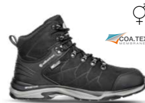
67.758.0 ISCHGL CTX MID O2 WR HRO SRC Size: 36 - 47