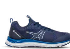
65.495.0 AER55 ST BLUE LOW O1 ESD HRO SRA Sizes: 41 - 47