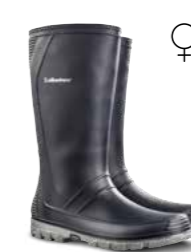
53.601.0 JUWEL LADIES & KIDS BOOT Sizes: 27 - 42