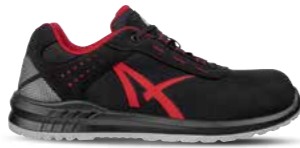
64.871.0 GRID LOW S3 SRC Sizes: 36 - 47