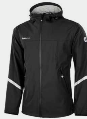
27.487.0 HADLEY // RAIN JACKET Sizes: S - 3XL