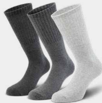
24.040.0 PROTECTION TRIO // ALLROUND SOCK Sizes: 39/42, 43/46