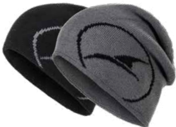
25.522.0 FREEZEGUARD // KNITTED CAP ONLY IN ASSORTMENS: 10 PIECES/COLOUR