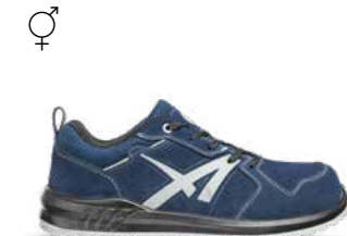
64.880.0 TWISTER DY NAVY LOW S1P ESD SRC Sizes: 36 - 47