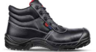
63.180.0 COMPACT MID S3 SRC Sizes: 36 - 48