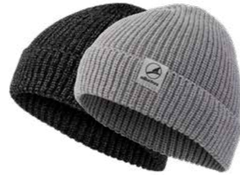
25.527.0 CLAY // KNITTED CAP ONLY IN ASSORTMENS: 10 PIECES/COLOUR