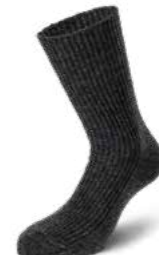
24.093.0 ARCTIC WOOL // SHEEP'S WOOL SOCK Sizes: 39/40, 41/42, 43/44, 45/46, 47/48