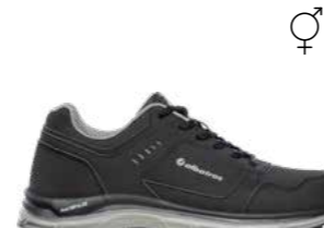
65.493.0 WHIZ ST BLACK LOW O2 ESD HRO SRA Sizes: 36 - 47