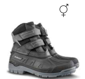
58.902.0 ONTARIO LINED VELCO BOOT Sizes: 36 - 47