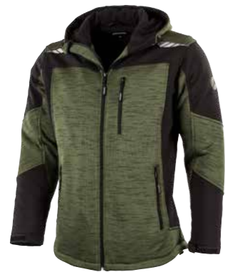
26.455.0 ALDRIN // FLEECE JACKET S - 3XL