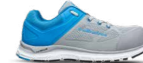
64.670.0 LIFT GREY IMPULSE LOW S1P ESD HRO SRA Sizes: 38 - 47