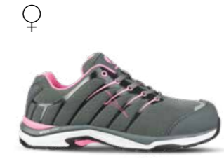
64.520.0 TWIST PINK WNS LOW S1PL ESD HRO SRC Sizes: 36 - 42