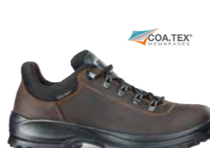
65.865.0 EIGER CTX LOW Sizes: 39 - 47