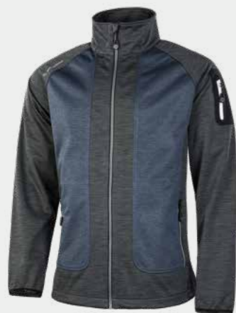
26.471.0 KINGSLEY // KNITTED/RECYCLING JACKET Sizes: S - 3XL