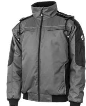
YKK CORDURA 28.660.0 EXPERT 360° // PILOT JACKET S - 3XL