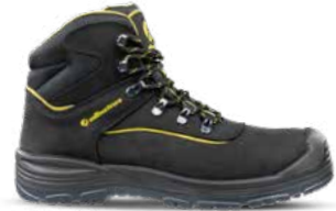
63.133.0 GRAVEL MID S3 SRC Sizes: 39 - 47