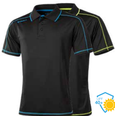
29.782.0 CLIMA // FUNCTIONAL SHIRT S - 3XL