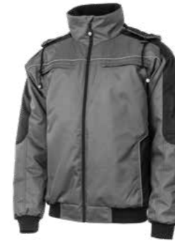
CORDURA YKK 28.660.0 EXPERT 360° // PILOT JACKET S - 3XL