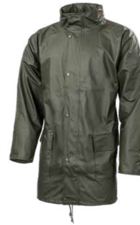
27.449.0 FAHRENHEIT JKT // PU-STRETCH RAIN JACKET S - 3XL