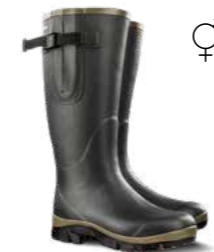
57.553.0 FOREST ISO NATURAL RUBBER BOOT Sizes: 37 - 47