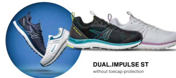
DUAL.IMPULSE ST without toecap-protection