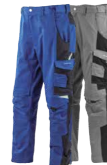
28.636.0 PROFI LINE // TROUSERS royal-blue: XS, XL - 4XL | 46, 54 - 60 grey-black: XS, M - 4XL | 46, 50 - 60