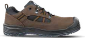
64.133.0 TIMBER LOW S3 SRC Sizes: 39 - 47