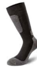
24.031.0 SAFE & SOFT // ALLROUND SOCK Sizes: 39/42, 43/46