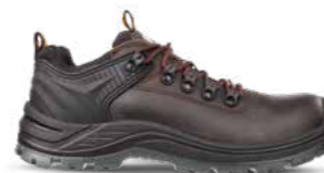
64.135.0 ENDURANCE LOW S3 SRC Sizes: 39 - 47