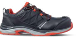
64.620.0 ULTRATRAIL BLACK LOW S3 ESD HRO SRC Sizes: 36 - 47