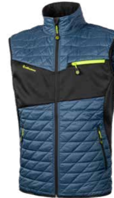
27.705.0 CONCEPT VEST // VEST S - 3XL