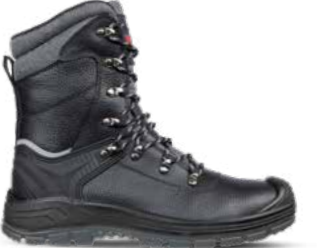
63.183.1 NORDIC HIGH S3 CI SRC Sizes: 39 - 47