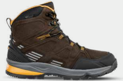
67.671.0 LOFOTEN 2.0 BROWN CTX MID Sizes: 40 - 46