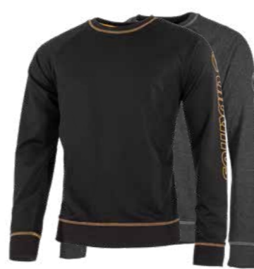
26.480.0 TYNAN // SWEATSHIRT S - 3XL