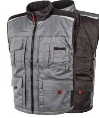
27.931.0 EDISON // WORKER VEST S - 4XL