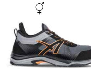
64.629.0 STUNNING LOW S1P ESD HRO SRC Sizes: 36 - 47