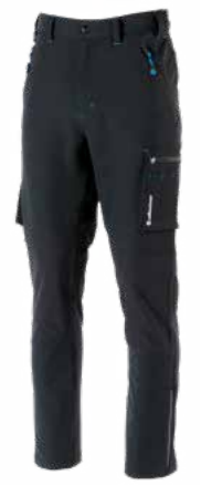
28.105.0 SKILL 4D TRS // STRETCH-TROUSER S - 3XL