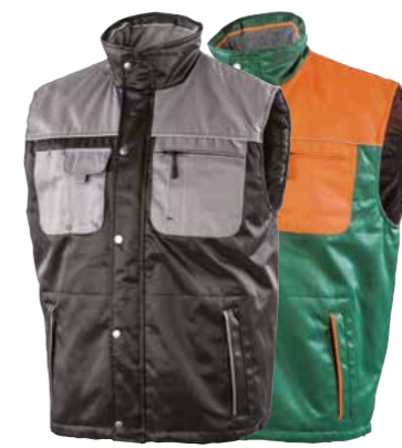
27.984.0 TESLA // WORKER VEST S - 4XL