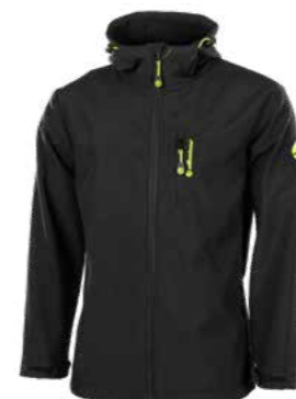
26.468.0 LAWRENCE // SOFTSHELL JACKET S - 3XL