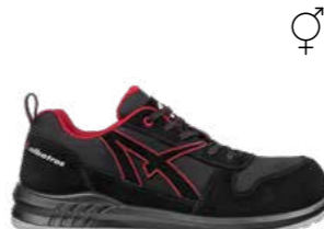
64.902.0 CLIFTON ST LOW O2 ESD SRC Sizes: 36 - 47