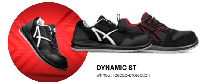
DYNAMIC ST without toecap-protection