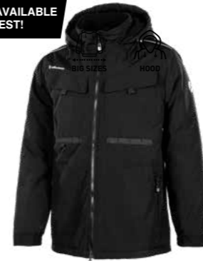
27.094.0 RANDERS // WORKER PARKA S - 3XL