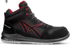
63.870.0 CLIFTON MID S3 SRC Sizes: 36 - 47