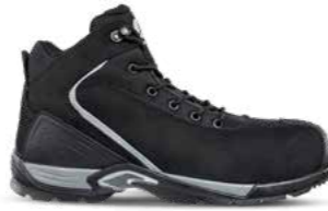
63.169.0 RUNNER XTS MID S3 HRO SRC Sizes: 39 - 47