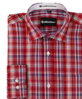
29.051.0 BRONZE 1/1 // LONG SLEEVE SHIRT 39/40 - 47/48