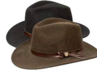
25.792.0 BOGART // WOOLFELT HAT Sizes: 55/56 - 61/62