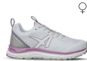
65.491.0 AER55 ST WHITE WNS LOW O1 ESD HRO SRA Sizes: 36 - 42