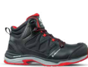
63.620.0 ULTRATRAIL BLACK MID S3 ESD HRO SRC Sizes: 39 - 47