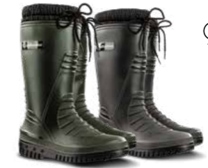
59.018.0 ARKTIS LINED BOOT Sizes: 36 - 48