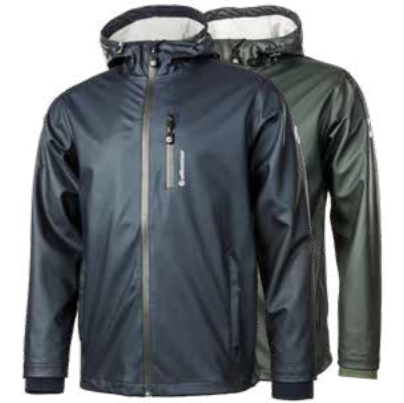
27.486.0 METEO // ANORAK S - 3XL