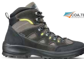
67.752.0 HIGHLANDS CTX MID Sizes: 37 - 47