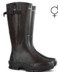
57.605.0 ARAGON NATURAL RUBBER BOOT Sizes: 39 - 47