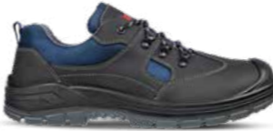
64.188.0 SAFE LOW S3 SRC Sizes: 39 - 47