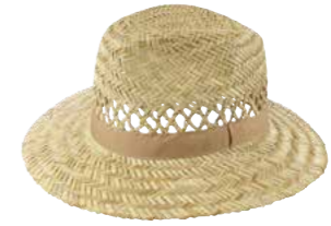
25.530.0 HARVESTER // STRAW HAT Sizes: 55/56 - 61/62