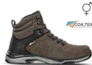
67.770.0 TRENTO CTX MID O2 WR HRO SRC Sizes: 36 - 47