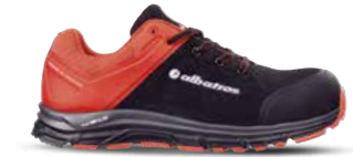
64.660.0 LIFT RED IMPULSE LOW S1P ESD HRO SRA Sizes: 39 - 47