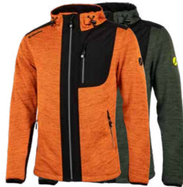
26.441.0 NAVARRA // KNITTED SOFTSHELL JACKET S - 3XL